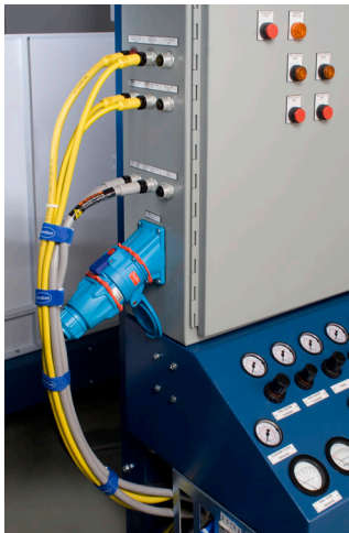
The Excel 3000 Powder Spray Booth features plug-and-spray technology that allows for fast and easy installation of all electrical components.

The compact and flexible color module design allows for a space saving, more compact footprint and easy to configure powder delivery options.