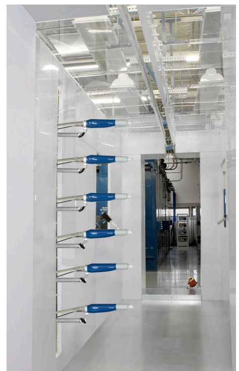
The optional PolyPlus™ wall panels provide enhanced light within the spray booth and low attraction of powder to the booth wall surface, allowing for fast, easy, and quick color change.

The durable yet functional canopy design features a clear copolymer roof for ample light during powder spray application and comes standard with PolyPlus wall panels. The PolyPlus wall panels provide enhanced light within the spray booth and low attraction of powder to the booth wall surface, allowing for fast, easy, and quick color changes. Booth walls are also available in optional stainless steel and feature the same sturdy design and construction as the standard galvanized steel wall panels. Each canopy material features a standard 2 ft. vestibule on both the exit and entrance end part openings for ample containment of powder within the booth.