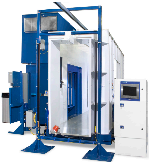
The modular design of the shorter more compact booth base allows for flexible location of both automatic and manual gun stations.

With plug-and-spray technology, low profile modular booth base, and optional PolyPlus™ canopy material, this innovative design provides large system features and benefits in a compact package that is easy to install, easy to operate, and easy to color change. The Excel 3000 Powder Spray Booth is available in 8,000 CFM, 10,800 CFM, and 14,000 CFM versions – in various modular and flexible system configurations.