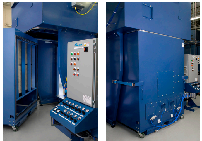
The compact and flexible color module design allows for a space saving footprint and easy to configure powder delivery options.