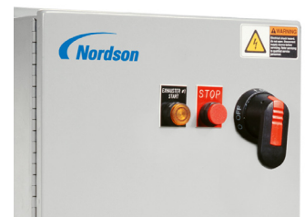
Econo-Coat II control panel