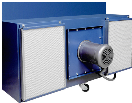
Econo-Coat II final filters (optional casters pictured)

Primary cartridge filters are cleaned using a reverse-pulse of air for maximum operating efficiency and extended filter life.