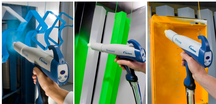
Nordson powder spray guns provide optimum coating performance.