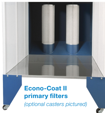
Econo-Coat II primary filters (optional casters pictured)